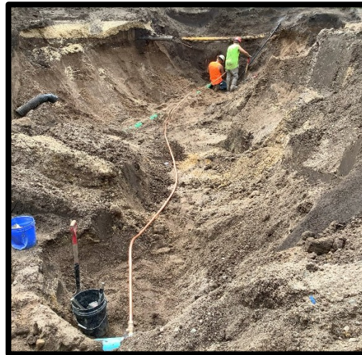
Water Service Replacements

Questions or Concerns? Please Call the Hastings Engineering Department at (651) 480-2334