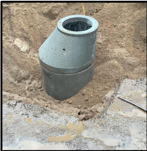
Sanitary sewer improvements