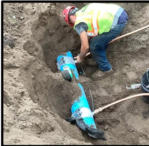
Water Service Replacements

Questions or Concerns? Please Call the Hastings Engineering Department at (651) 480-2334