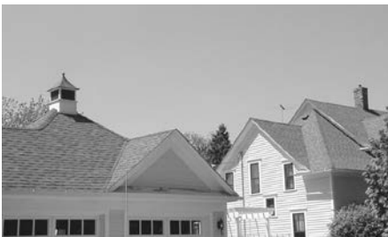
Garages and accessory buildings adjacent to historic houses should have compatible roof slopes and massing.