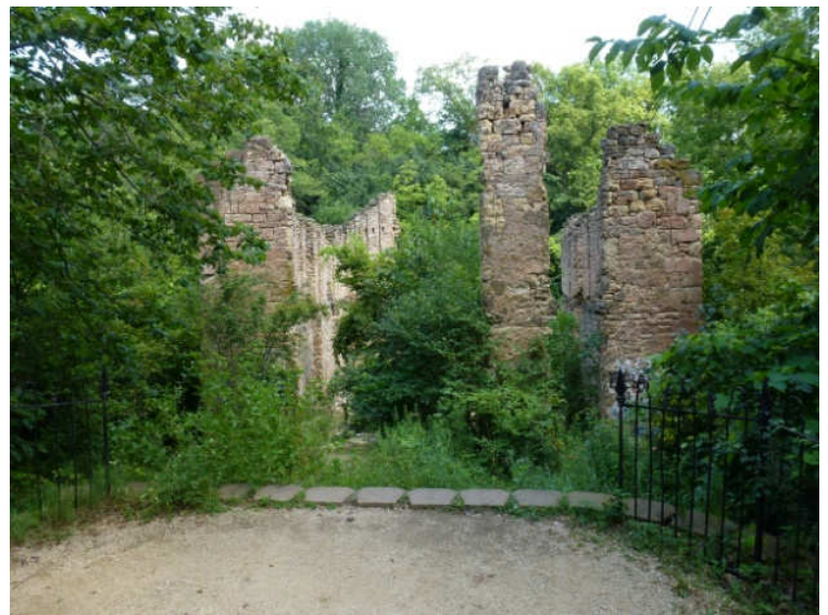
Old Mill Ruins