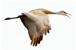
Sand Hill Crane

Here is the real gem for birding in our city! The River Flats area includes the land between the Mississippi River and Lake Rebecca from Jaycee Park to Lock and Dam #2. Historically the area was a mix of oak savannah and flood plain forest. The Lock & Dam changed the original habitat but through important partnerships made with the city a large amount of natural area has been preserved. The Parks Department maintains trails that provide access to the restored