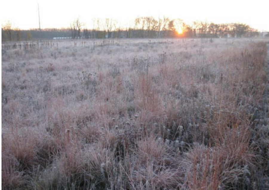
Hastings River Flats